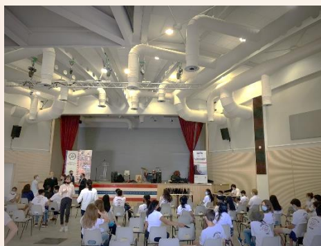
Students in salle polyvalente

Many activities were organised for one and all throughout the week. We had a spectacular and deeply moving cinematic experience that featured award-winning films, which vividly portrayed American history. The favourite movie was "Selma", about Martin Luther King. The personality inspired a grand exhibition to commemorate the greatest human rights activists of the USA. Another greatly appreciated project was, of course, the selling of American delicacies that attracted all the fine gourmets of LDM.