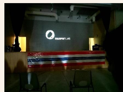
Film show "Selma"