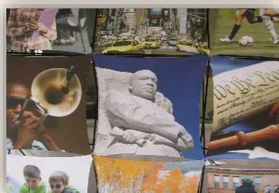
Presentations prepared for the occasion

The week of October 18 was a unique experience for all students and teachers of the LDM, since it marked the opening of the very first, long awaited, American Week by LDM. More than an academic oriented event for the students of the British section, it was above all a cultural and artistic experience and a time of sharing that bonded all the sections of the LDM.