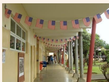
Hallways adorned in American colours