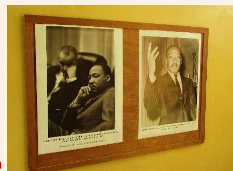
Martin Luther King exhibition