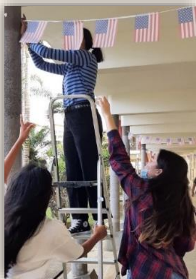
A few students of 1 ère at work

Thanks to the active involvement of the student body, the week was a phenomenal success. Among the many responsibilities given to the talented lycéens, the school's decoration was the best accomplishment. The lycée was gleaming in American colours, from gigantic flags and stunning ornaments to the clever disguises representing the western world, perfectly setting a lively atmosphere that prevailed until Friday evening.